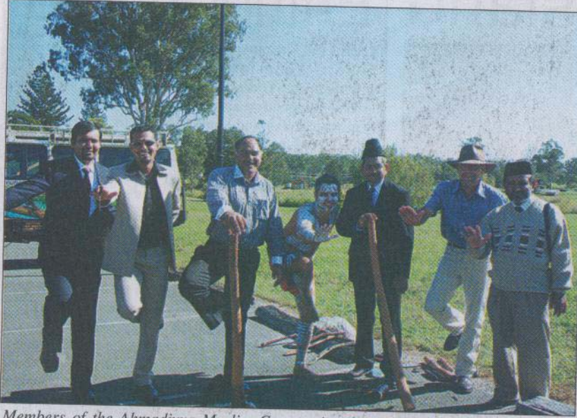
Members of the Ahmadiyya Muslim Community showed off the corroboree dance moves they were taught at the Bearded Dragon Tavern on Saturday.