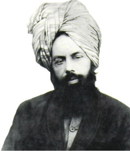
Hazrat Mirza Ghulam Ahmad The Promised Messiah & Mahdi as

Allah the Exalted Allah, the Exalted, the Glorious, Hallowed be His Name This wealth is worth procuring though one might have to lay down one's life to procure it.