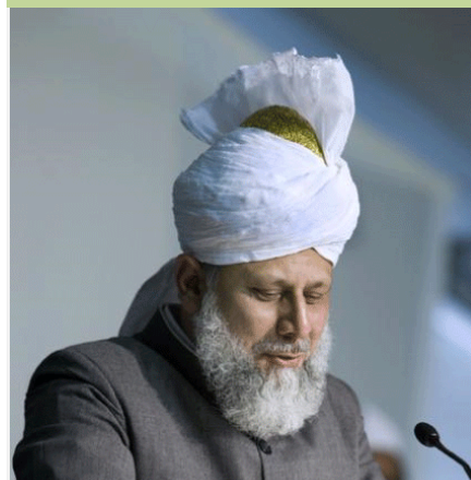
Hazrat Mirza Masroor Ahmad Khalifatul Masih V

Ḥuḍūr عليه السلام said: We have pledged to establish the supremacy of the Holy Qur’ān and this is what makes us distinct from other people. The Holy Qur’ān should have such a place in our hearts that it becomes manifest in our every word and deed. Ḥaḍrat Masīḥ Mau’ūd عليه السلام says, “The Holy Qur’ān is the source of true blessings, the only means of salvation and a cure for all ills. This book is the key to all our progress and success, and this book alone should be followed. You should realize that the Holy Qur’ān is a source of all bounties and you should value it, that is to say, act upon it, so that you may see how God saves you from all tribulations. If only people would realize the excellent guidance that Allāh has provided them in the form of the Holy Qur’ān and if only they would benefit by following it.”